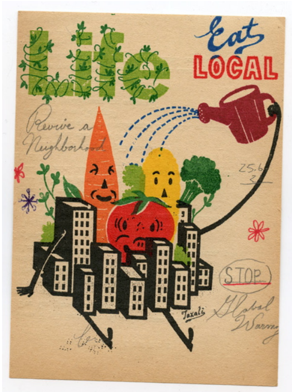
From The Taxali 300

own garden by this jolly bunch than by swooping panorama shots of wind farms and solar panels. Furthermore, the happy food group doesn't force a tenuous connection between global sustainability and my vegetable garden, but rather, captures the charm of the DIY mentality without taking on an air of self-importance.