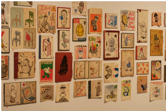
Installation view | The Taxali 300 at Narwhal Art Projects

Gary Taxali and the team at Narwhal Art Projects have brought together a collection of original illustrations by Taxali. Hundreds of works are assembled in groupings that flow like a free form comic strip. Ranging over the generous displays is an experience that lends itself to playful associations amongst neighbouring illustrations, while demonstrating Taxali's dexterity as a visual communicator; tracing themes throughout the exhibition is inevitable. Common visual tropes, such as the delicate tones of antique papers and the imperfections that come with Taxali's screen-printing process, along with a crew of retro-Americana characters, carry a viewer along the busy walls.