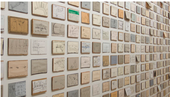
Installation view | Postcards from the World

By constantly translating the ideas and issues that he encounters on his travels into cartoons, which he records continuously in notebooks, Perjovschi captures the attitudes and behavior of local communities as well as his reaction to changes in place iv . Each installation is an edited and enlarged version of these notebooks v . Perjovschi adds a humanized character to his work by taking such a personal approach to art making. "Everything I see is linked after all with the way I see things, and with what happened to me," Perjovschi tells us vi . Art is a working out of everyday experience in Perjovschi's practice, where drawing maintains the humility of a journal entry.