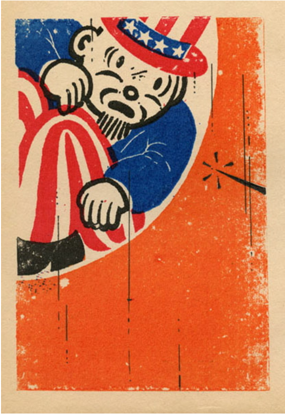
From The Taxali 300 | Courtesy of Narwhal Art Projects

Fallibility is the aspect of human nature that Taxali has shown us so skillfully. Taxali has given us a renewed humility in the form of his jovial characters, which drop the pretense of a sleek, serene vision of a revitalized, green American economy. The self-consciously caricatured quality in Taxali's work, which is achieved with a charming handling of the visual legacy of the American dream, not only makes the hubris of American finance laughable but also humbles contemporary attempts at easily encapsulating the flaws in our economic system. Taxali's handling of the now-quaint mascots of the past reveals that both the new and old must stand together in their acceptance of their fallibility and the uncertainty of their grasp of present crises. Taxali's