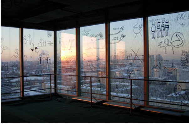
Installation view | Footnotes on Geopolitics | Market and Amnesia at the 2nd Moscow Biennial

meathead is all talk. His images have such rich character not only for their wit, but also for the development of themes that reoccur across the passages of time and place that Perjovschi captures in his notebooks.